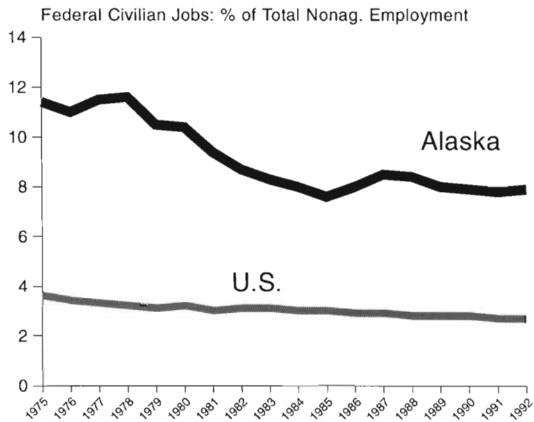
Figure • 2

Note: Includes civilian military.